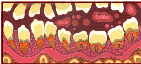
Artwork by Students & Staff of the Wesley Art Program, Reiby Juvenile Justice Centre