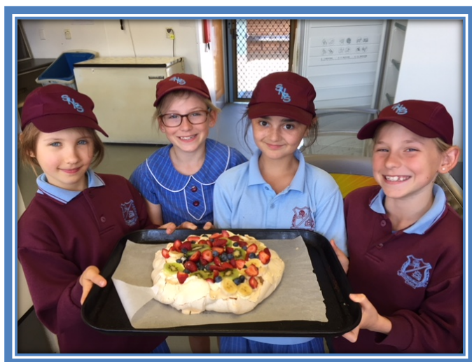
Year 3 Girls with the Pavlova they made together.