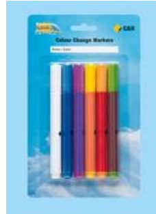
Colour Change Markers

For every deposit made at school students will receive a silver Dollarmites token. Once students have individually collected 10 tokens they can redeem them for exclusive School Banking reward items in recognition of their regular savings habits. There are two new items released each term so be sure to keep an eye out for them!