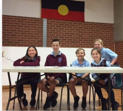
B Team Debators