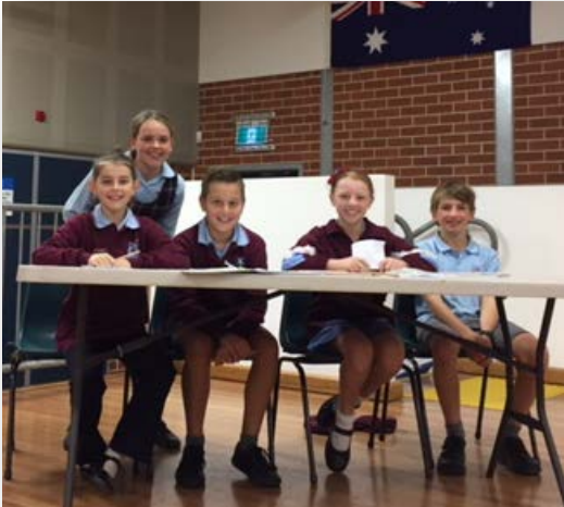
A Team Debators