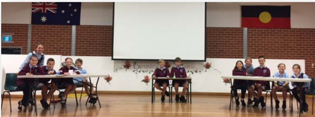
Ready to Debate!