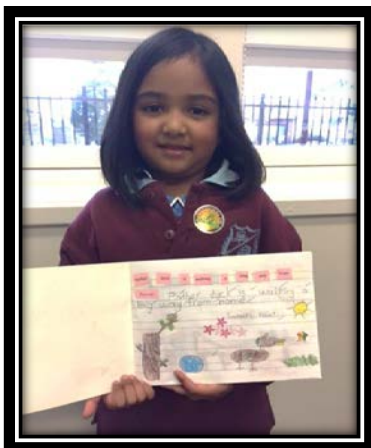
Sydney in 1K

With the cold weather now upon us, the number of jumpers and jackets lost or misplaced is increasing. Sometimes children pick up another student's jumper by mistake. Please check your children's clothing to ensure it does not have another student's name on it. If this is the case just return the item to school so it can be given to the correct child. Thank you.