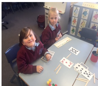
Subtraction is fun!