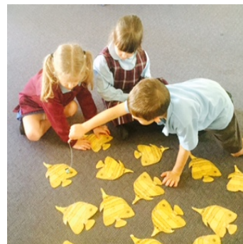
I caught .....