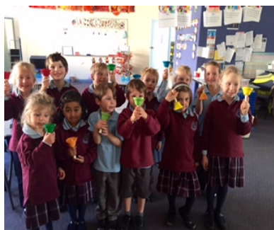
We are learning to read a music chart!