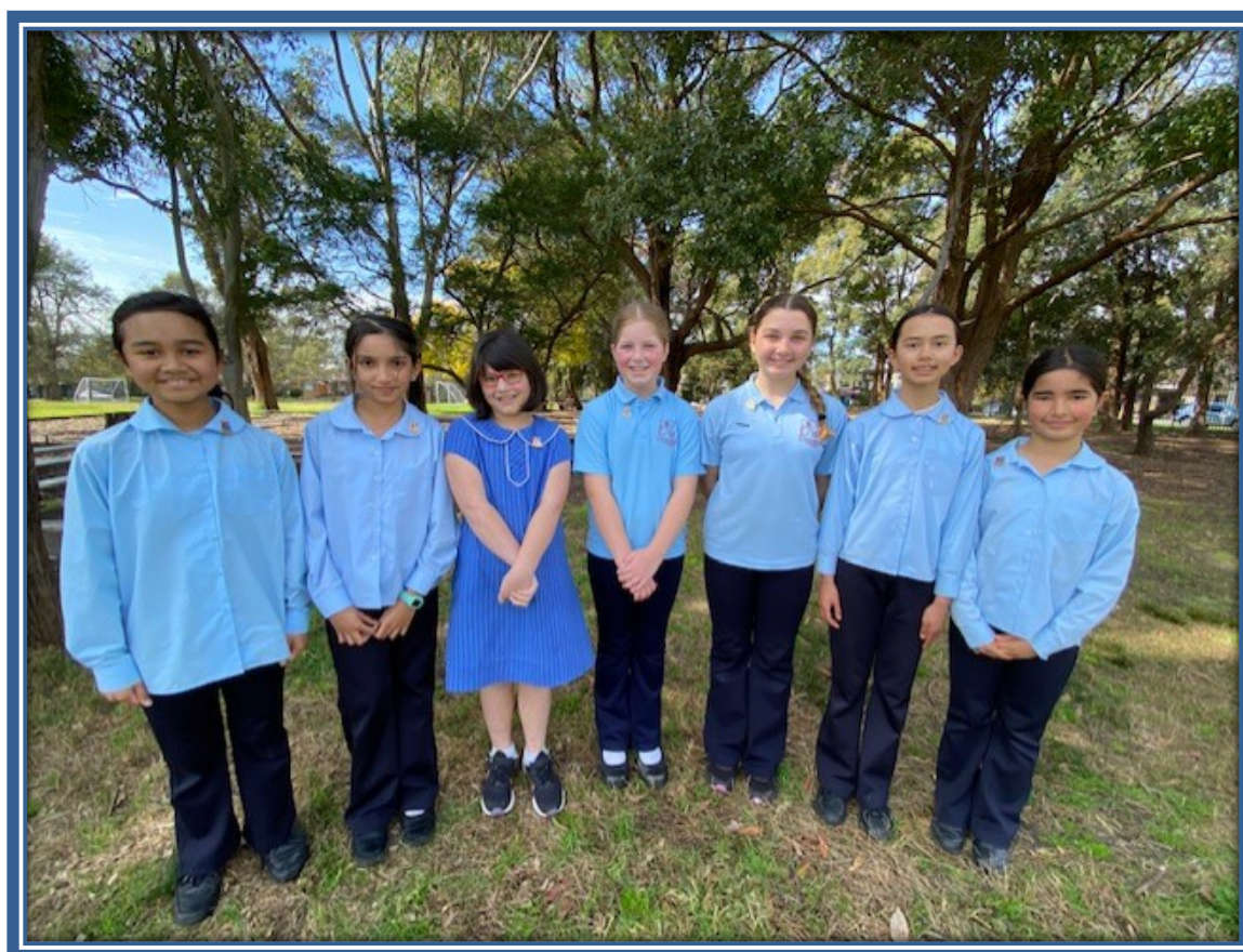
Congratulations to our Principal Badge recipients!