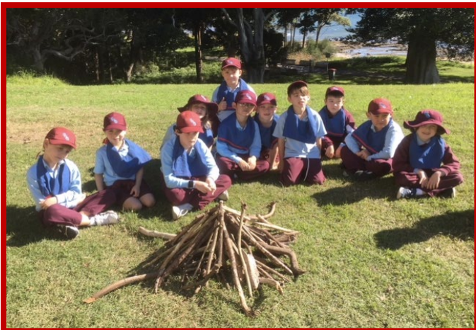
The boys collected wood and constructed a fire.