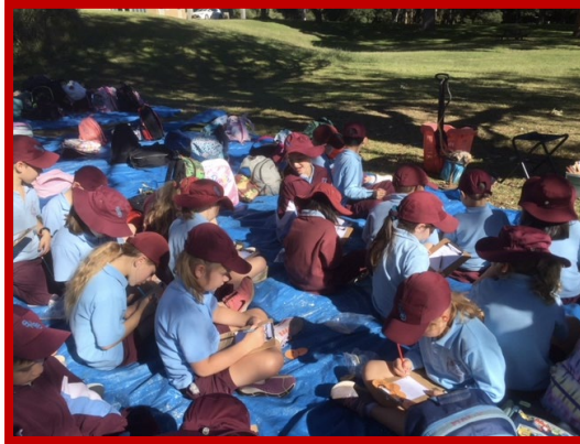
Writing stories using symbols.