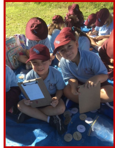
Working with a buddy.