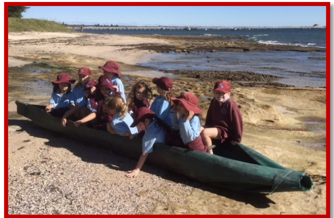
Sitting in a canoe ready to go fishing. When the tide comes in!