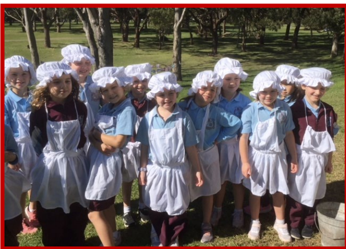
The girls have just used scrubbing boards to do the washing, which is now on the line drying.