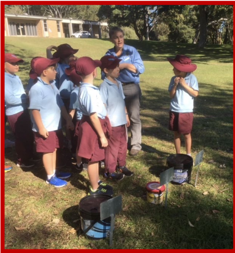
Learning about Australian wildlife.