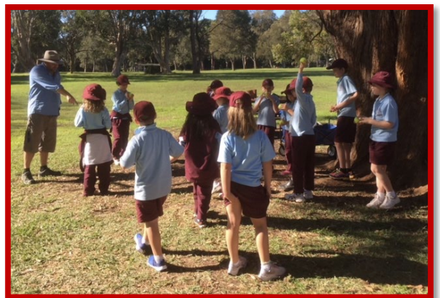
We are learning how to hunt for emu eggs.